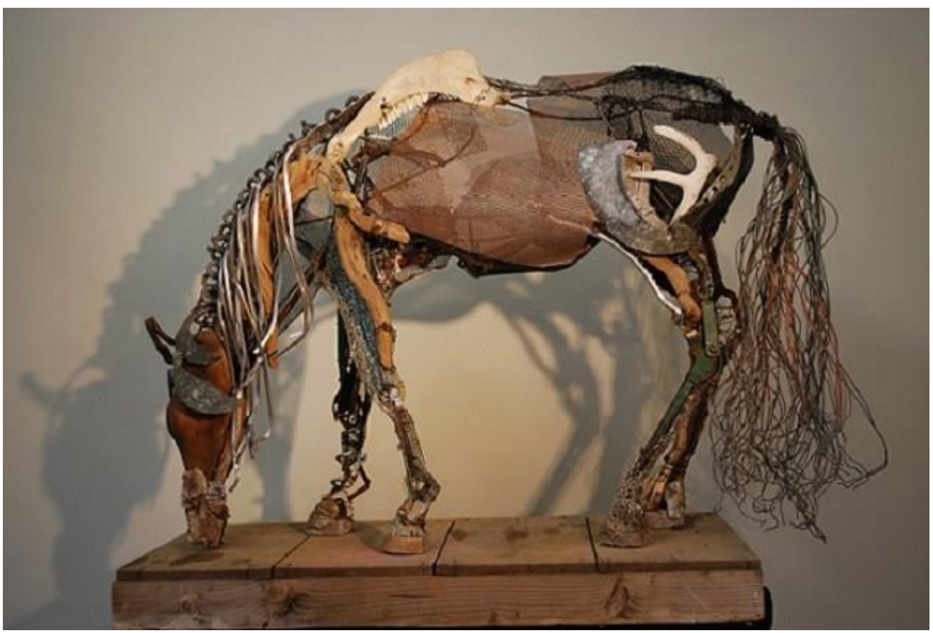
"Sometimes I find a piece of scrap metal or wood that is interesting to me. It will 'look like a part of something' to me—perhaps the shape will remind me of a of a human leg, a samurai's skirt, or a rabbit's ear, and then I think about what the rest of a sculpture might look like. I base the scale of the sculpture on the size of